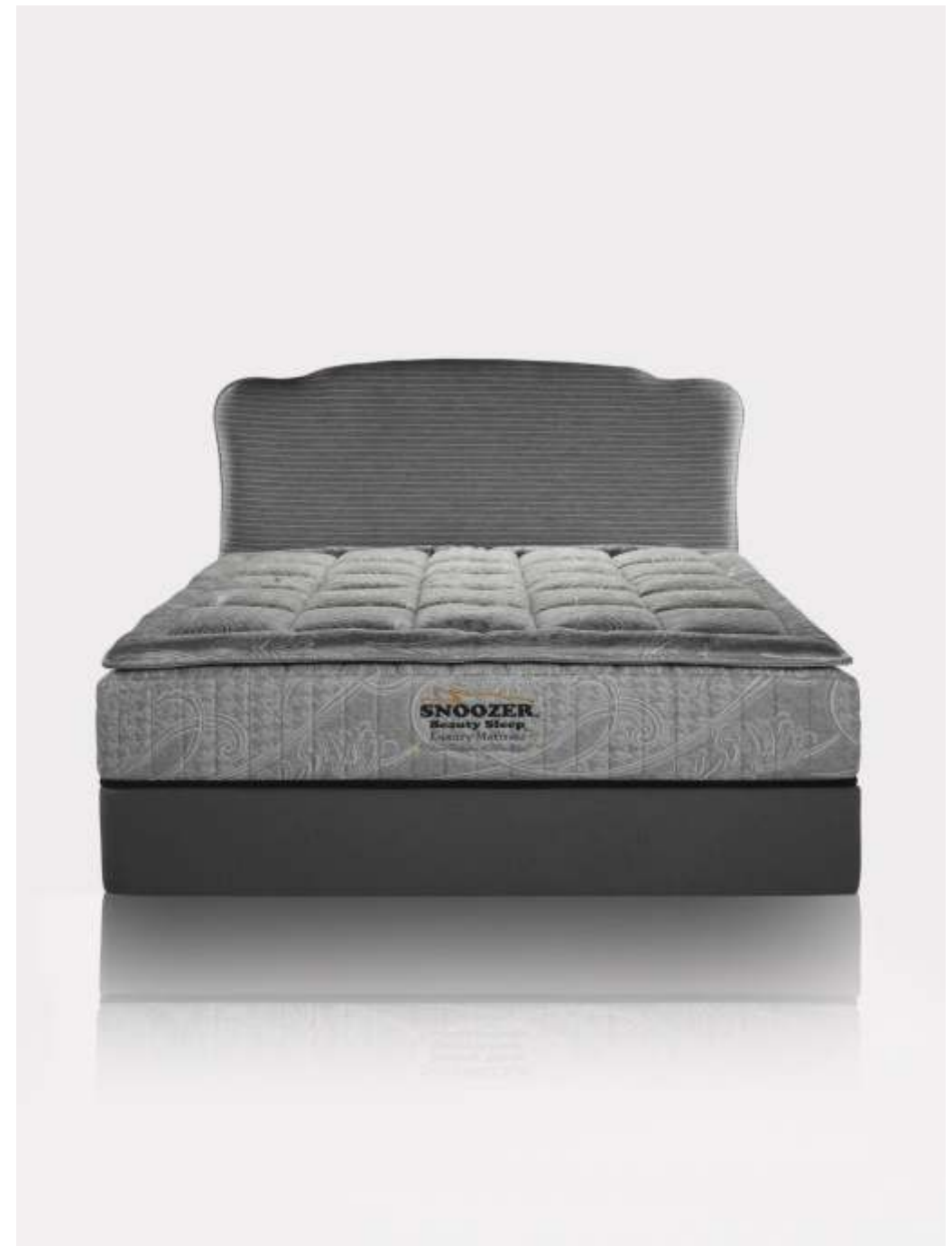
Beauty Sleep® Mattress

With a minimalistic waterfall design and firm sitting edges Snoozer Beauty Sleep Mattress is reputed to be the best luxury mattress in the country for over two decades.