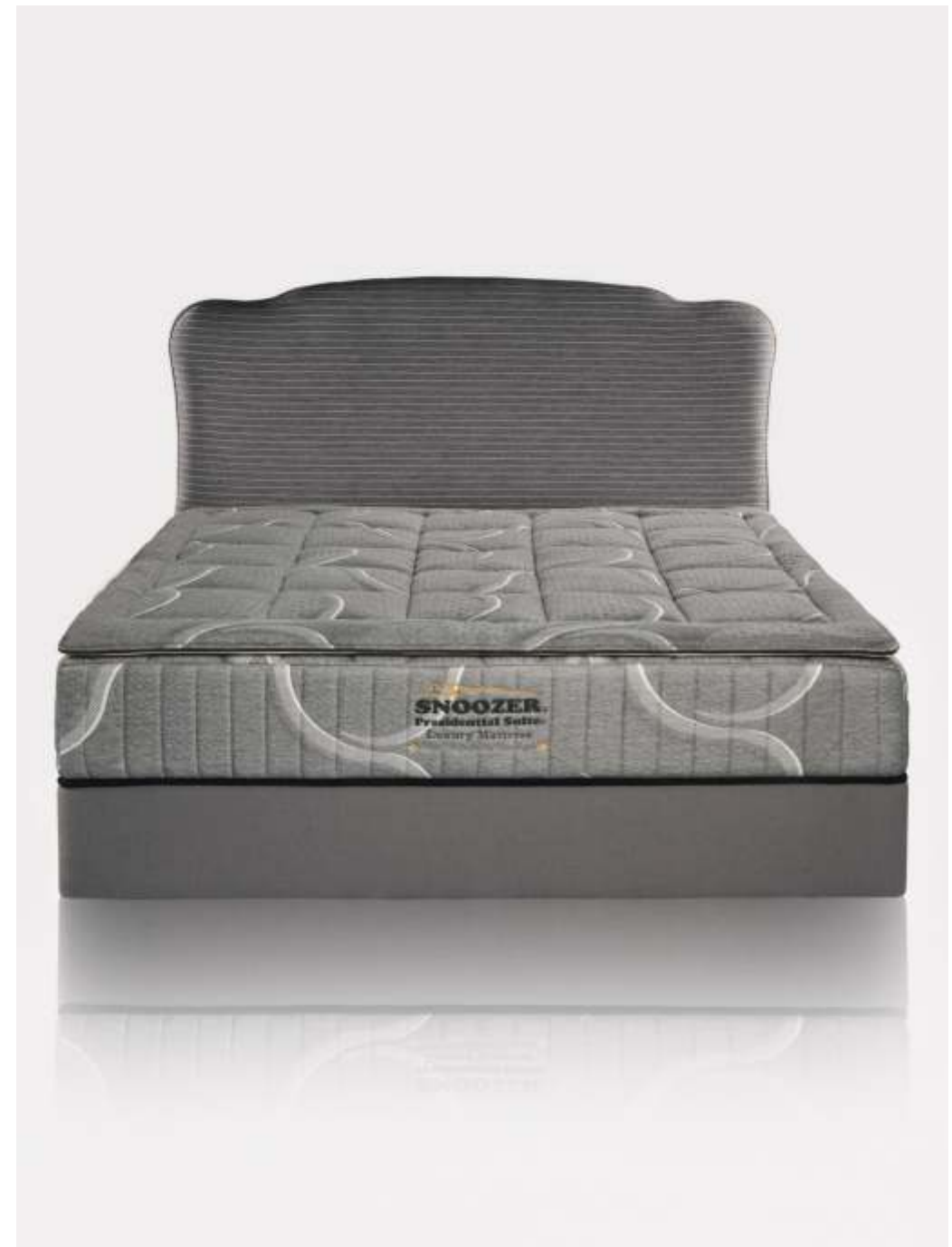
Presidential Suite® Mattress

Presidential Suite Mattress is made with advanced coil spring support which deep down flexes silently and adapts to your body helping you give the right comfort & support preferred worldwide.