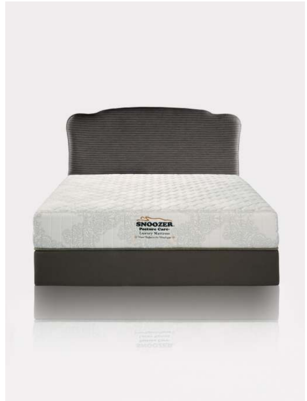
Posture Care® Mattress

This mattress therefore provides the right balance of a medium firm feel - neither too hard nor too soft, making it the best mattress suitable for all ages & preferences.